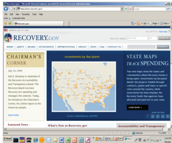
Recovery.gov – Tracking Stimulus Spending