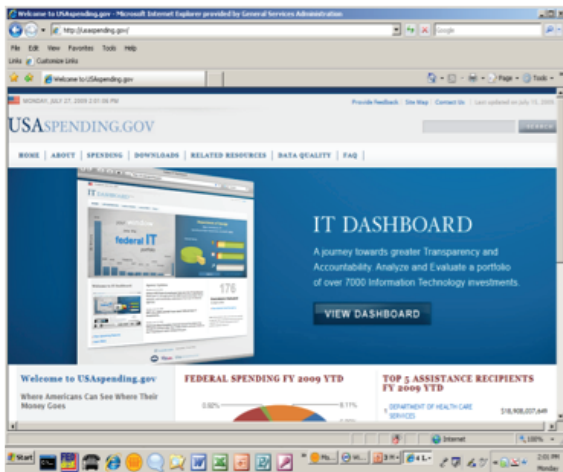
IT Dashboard – Visualizing IT Spending

From listening tours to webcasts to town halls, the White House and federal agencies are opening up the way they work. It's almost hard to believe that the first blog in the federal government only began in 2008!