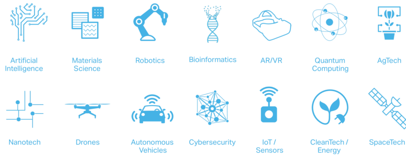
Figure 1: Technologies commonly considered to be part of “DeepTech”.

“DeepTech” refers to companies and innovators building science-based or R&D-based products and services. These technologies often have transformational potential if successful. They could trigger transformative shifts in the way businesses operate, how our national security is protected, or how an entire field of discovery thinks. It’s impossible to overstate the importance of DeepTech. The United States needs DeepTech products and services to address the Biden-Harris Administration’s top priorities: from the COVID-19 pandemic, to climate change, to the nation’s economic recovery.