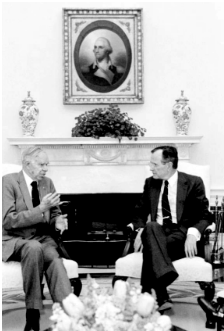
At the White House, Seaborg is briefing President George Bush on cold fusion (April 14, 1989).

In the spring of 1941, it was determined that the newly discovered isotope plutonium-239 could undergo fission and had potential as a powerful nuclear-energy source. Consequently, Seaborg left Berkeley to head the University of Chicago's Metallurgical Laboratory (known as Met Lab) and develop the chemical separation process that would provide plutonium-239 for the Manhattan Project, which was aimed at creating a secret nuclear weapon. Still in Chicago after completion of the plutonium project, Seaborg focused his attention on looking for new elements heavier than plutonium.