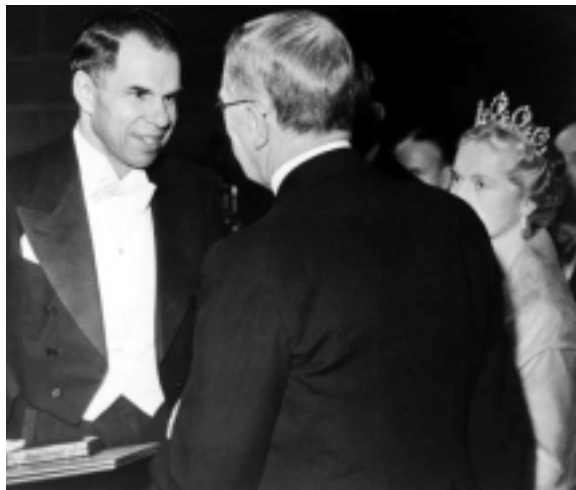
The King of Sweden presents the Nobel Prize to Glenn T. Seaborg.

Seaborg advocated a ban on nuclear weapons testing and argued for nuclear arms reduction and dismantlement. He strongly advocated the conversion of weapons-grade plutonium into mixed-oxide (MOX) fuel to “burn” in nuclear power reactors for peaceful purposes. In concert with the work of Russian counterparts, Seaborg’s work would help ensure a lasting peace after the Cold War and reduce threats of proliferation and potential acts of terrorism. “I was a codiscoverer of plutonium in 1941 at Berkeley. I have always felt a parental pride in its potential for good—its ability to provide the world with a clean energy source virtually forever. But I also am fully aware of the great threat it can pose in the wrong hands...” said Seaborg (1997)