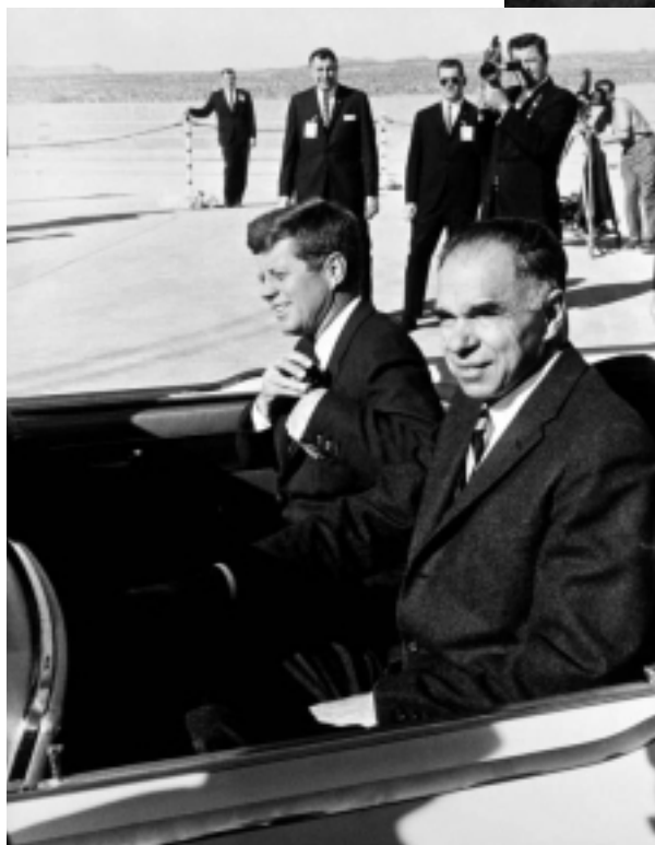
(Bottom) John F. Kennedy and Glenn T. Seaborg during the President’s visit to the Nevada Test Site on December 8, 1962. This was one of Seaborg’s favorite pictures with President Kennedy.