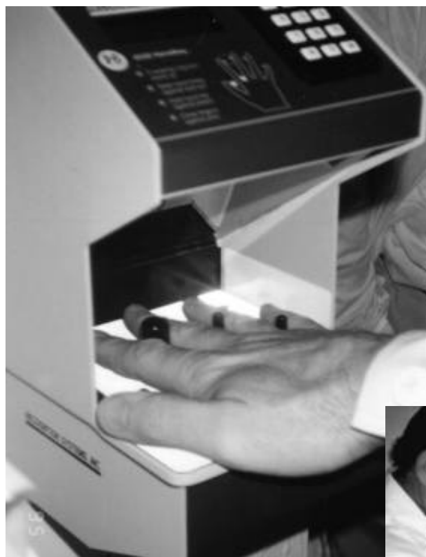
Figure 3. Access Controls The palm reader on the left determines a worker's identity on the basis of the size and shape of their hand. The size and shape are calculated from the capacitance between the hand and a grid of plates inside the palm reader. The palm, badge, and personal identification number readers (below) are used to identify workers throughout a nuclear facility. On the basis of a worker's identity, access to nuclear materials may be allowed or denied.

officers obtain keys to the Materials Balance rooms from the Key Access area. They are required to operate in teams of three that consist of two materials handlers and a security officer. All three must be identified by their palm, badge, and personal identification number. Then, if the team has permis-