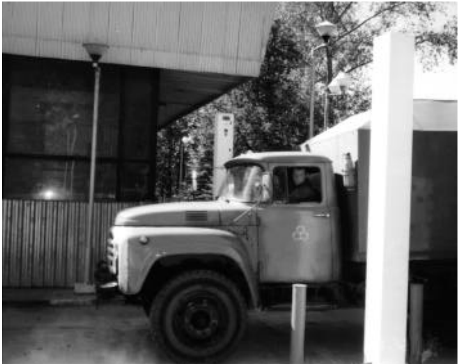
Figure 8. The Vehicle Monitor

In reactor research, fuel rods of various configurations are built out of large numbers of disks such as the one above. Bar coding the disks that contain nuclear material was the first step in the implementation of computerized accounting at IPPE.