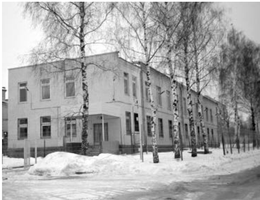
Figure 9. Building 116

We focused our efforts on Building 116 where two critical assemblies, the Nartzis and the Astra, are used for nuclear reactor studies. Like the disks at IPPE, the nuclear material used in Building 116 is in relatively small, and therefore vulnerable, units—tiny “pellets” for the Nartzis and baseball-sized “pebbles” for the Astra. Thousands of