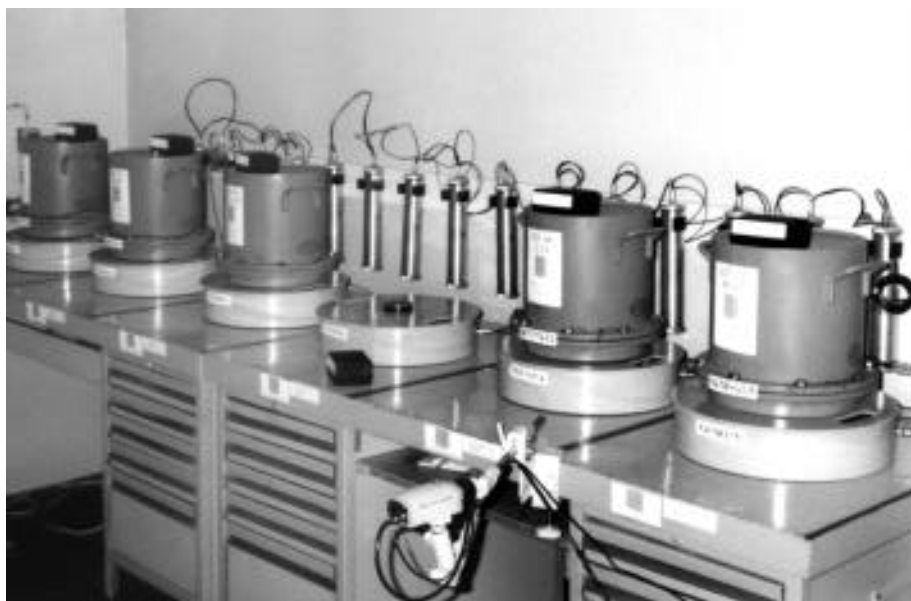
Figure 6. The Vault

In January 1995, only six months after the contracts with Arzamas-16 had been signed, the demonstration facility