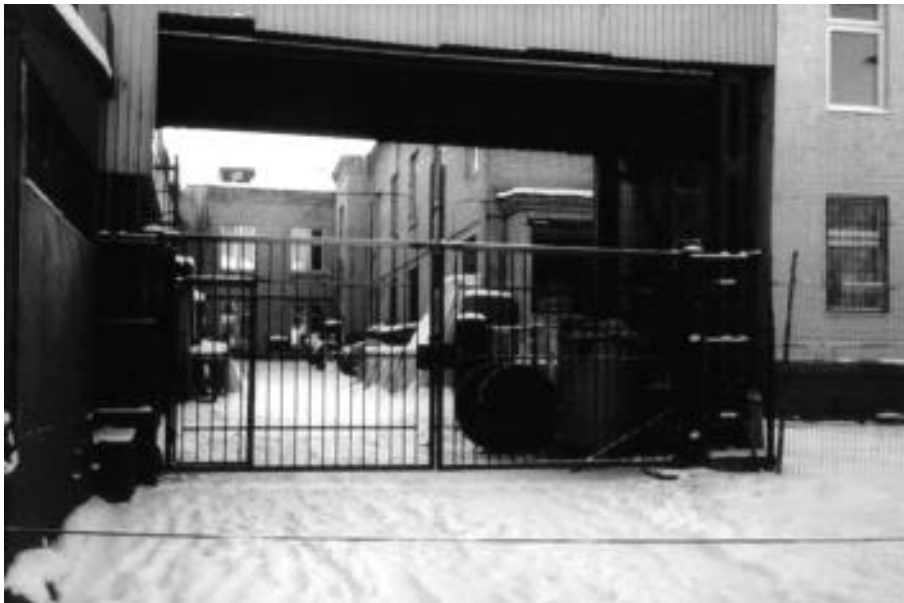
Figure 10. Before and After

The top photograph shows the gate outside Building 116 of the Kurchatov Institute before the lab-to-lab MPC&A program, and the bottom photograph shows the same gate after. Physical protection such as strong fences and secure gates is the focus of our work at the Kurchatov Institute.