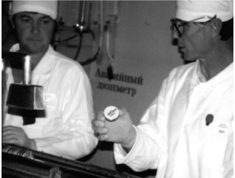
Figure 7. Researchers at IPPE

In reactor research, fuel rods of various configurations are built out of large numbers of disks such as the one above. Bar coding the disks that contain nuclear material was the first step in the implementation of computerized accounting at IPPE.