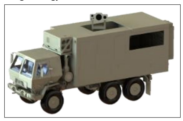
Figure 5. Prototype High Energy Laser Tactical Vehicle Demonstrator (HELTVD)