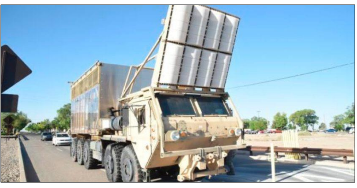
Figure 4. Prototype Max Power System