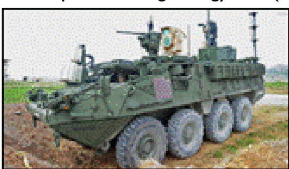
Figure 7. Mobile Experimental High Energy Laser (MEHEL 2.0)

The MEHEL is a system that permits experimentation and provides the soldier with hands-on experience operating a HEL mounted on a Stryker combat vehicle (see Figure 7 ). It currently mounts a 5 kilowatt laser and was used in exercises in 2017, where it was able to defeat a number of small rotary and fixed-wing UAVs.