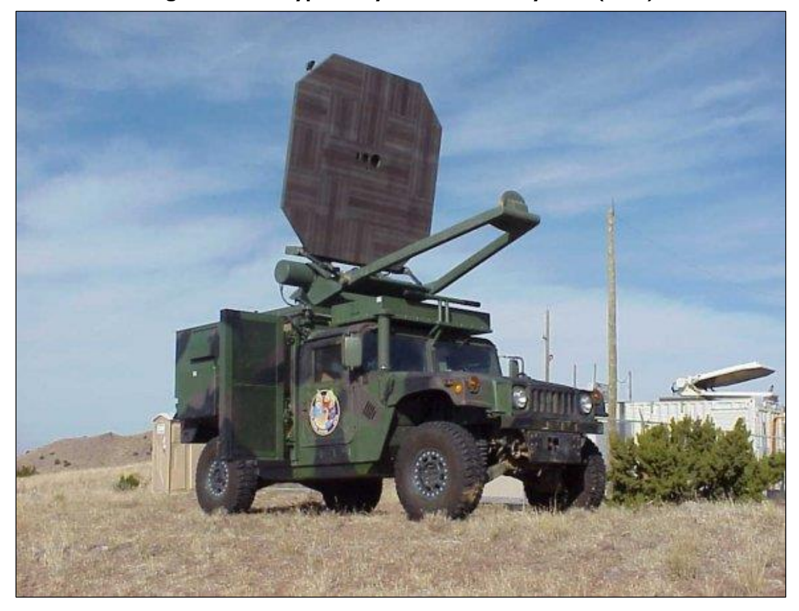
Figure 3. Prototype Army Active Denial System (ADS)

destroy IEDs on the battlefield.<sup>30</sup> In 2012, a Max Power prototype was reportedly deployed to Afghanistan for nine months of testing where it was used for 19 combat missions with "convoys across IED-infested roads and highways."<sup>31</sup>