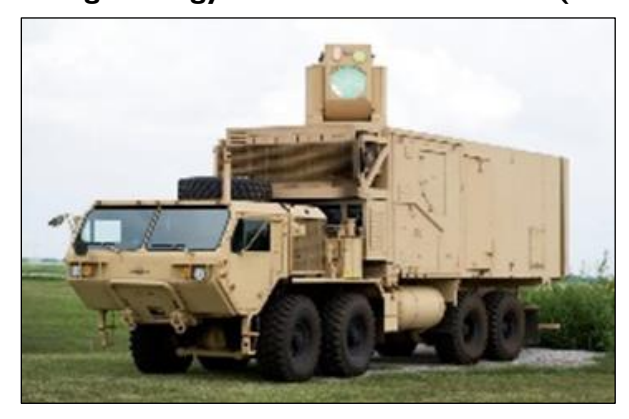
Figure 8. High Energy Laser Mobile Test Truck (HELMTT)

The HELMTT program involves mounting a 50 kilowatt laser on an existing Heavy Expanded Mobility Tactical Truck (HEMTT) (see Figure 8 ). HELMTT is being used to collect test data that are expected to be used to develop the next generation of HELs and inform future requirements.