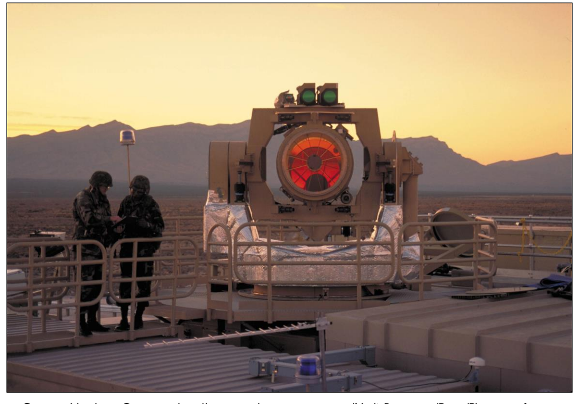
Figure 2. Tactical High Energy Laser