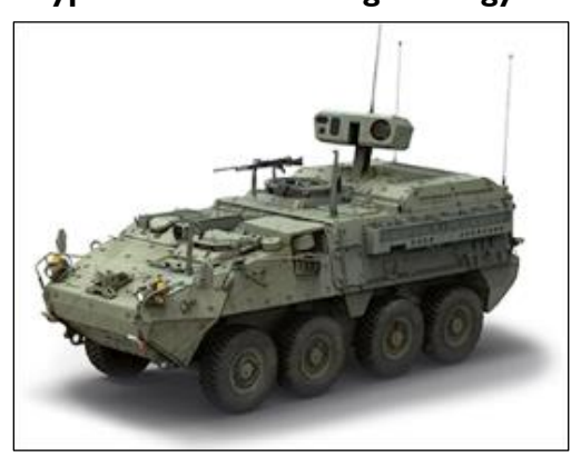
Figure 6. Prototype Multi-Mission High Energy Laser (MMHEL)