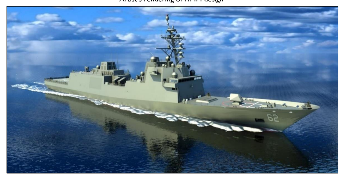
Figure 2. Constellation (FFG-62) Class Frigate Artist's rendering of F/MM design