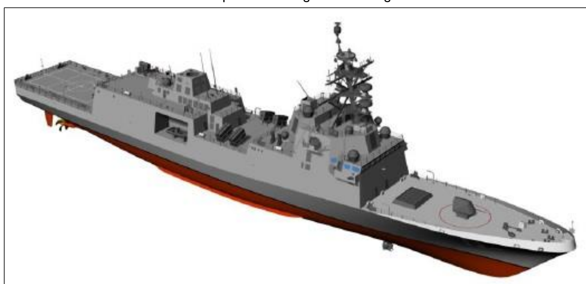
Figure 4. Constellation (FFG-62) Class Frigate