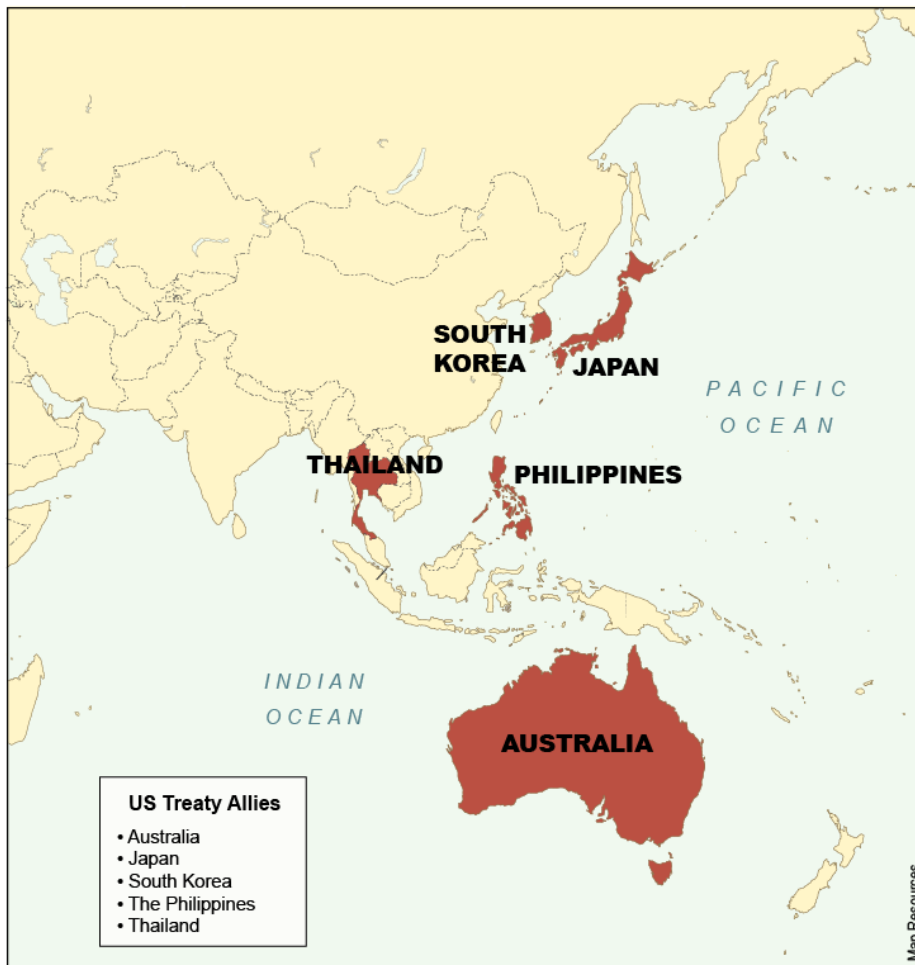
Figure 3. The United States Treaty Allies in Asia

Thailand is viewed as seeking to balance its American relationship with one with China; New Zealand was de facto dropped from the Australia-New Zealand-United States (ANZUS) alliance in the mid 1980s; poor relations with the Philippines led the United States to leave its military bases there in 1992 and there are signs of emerging differences in the U.S.-Republic of Korea relationship. Despite these developments, the system has endured because the correlates of power in post war Asia have not “altered in a way that suggests that the United States is not a useful balancer of last resort.” 53 Figure 3 shows the locations of the United States’ regional allies.