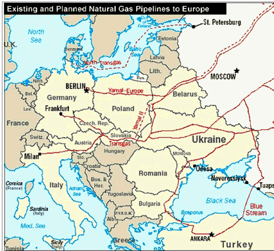
Figure 6. Natural Gas Pipelines to Europe