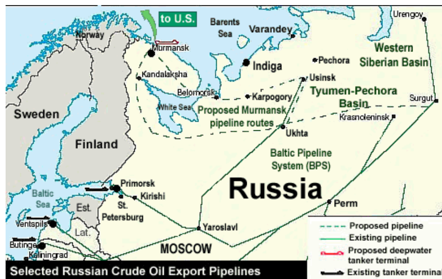
Figure 3. Selected Northwestern Oil Pipelines