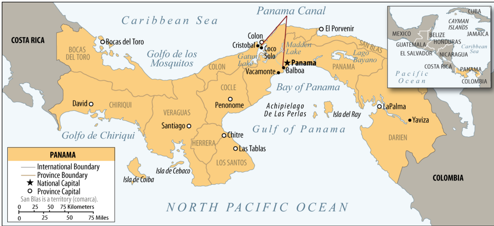
Figure I. Map of Panama