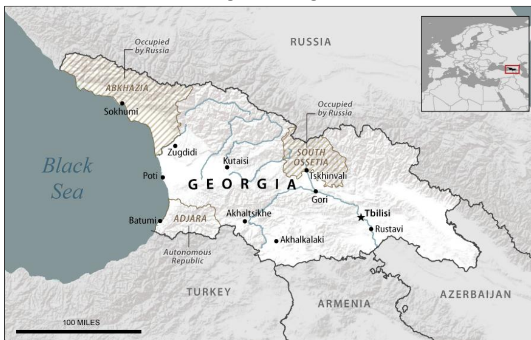
Figure I. Georgia