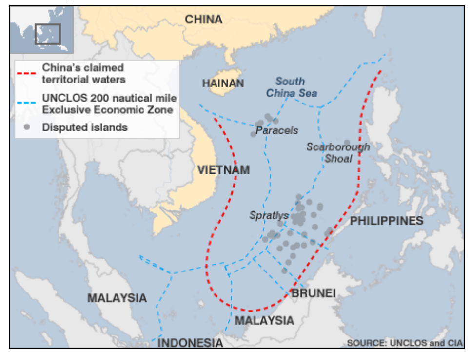
Figure 2. Contested Boundaries in the South China Sea

blocked two Philippine supply ships from reaching the Sierra Madre , claiming that they were carrying construction materials.