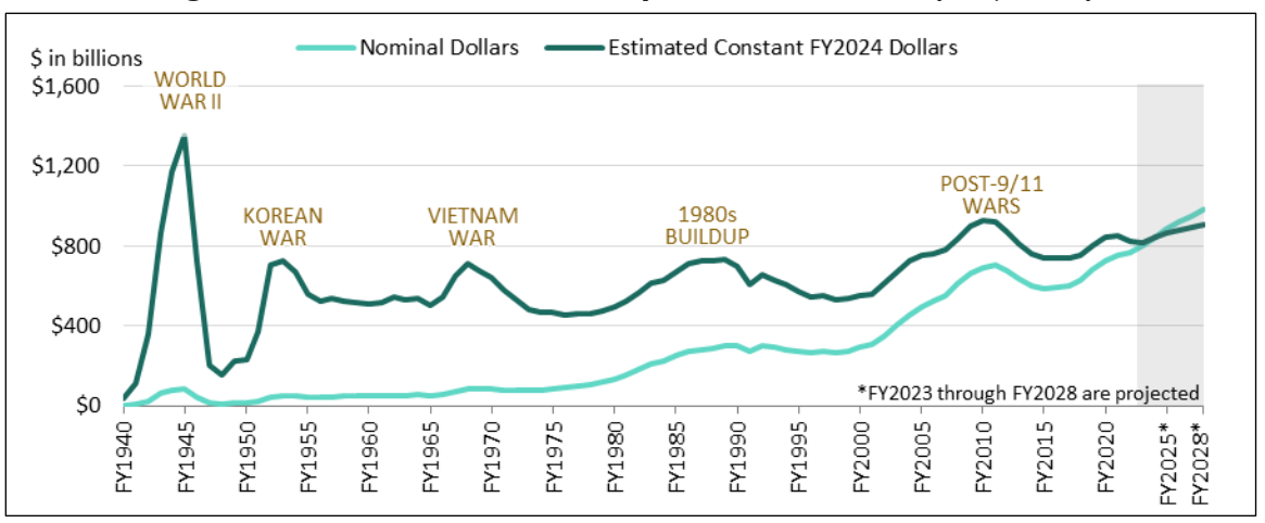
Figure 3. National Defense Outlays, FY1940-FY2028 (Projected)

Sources: CRS Report R47582, FY2024 Defense Budget Request: Context and Selected Issues for Congress, by Cameron M. Keys and Brendan W. McGarry. Figure created by CRS using data from the Office of Management and Budget (OMB) Budget of the United States Government, Fiscal Year 2024, Historical Tables, Table 3.1 and Table 10.1, March 2023, and the Congressional Budget Office (CBO), Budget and Economic Data, Spending Projections, by Budget Account, February 2023.