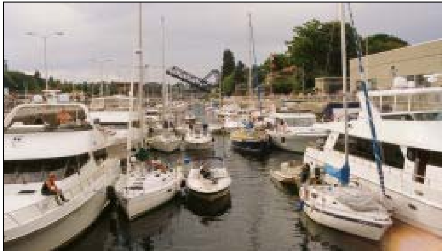
Figure 2. Pleasure Boaters Awaiting Free Lock Passage Through the LWSC

Another example of an expensive canal of little use to shippers is the Lake Washington Ship Canal (LWSC) that connects the Puget Sound with Lake Washington. Although located in Seattle, no shippers use the canal because all of the Port of Seattle's cargo terminals are located on the Sound, thus ships have no reason to transit the canal. The canal's cargo traffic is limited to intraport barge movement of sand and gravel, but it has cost HMT taxpayers $63 million to maintain over the last ten years which, like Grays Harbor, is tens of millions more than the costs to maintain the Ports of Seattle and Tacoma shipping channels combined. On a daily basis, an average of 100 pleasure boats (see Figure 2 below), transit the canal, accounting for about 82% of the canal's traffic. (Boaters prefer to dock in freshwater as there are no tides to contend with). Based on the number of vessels of all types that have transited the canal over the last decade (538,135 vessel transits), each vessel would have to pay $117 per transit if the maintenance costs were to be recovered from the canal's users. This indicates the nominal value that shippers are providing recreational boaters each time they pass through the canal. If recreational boaters were charged a fee based on the size of their boat, some say, it could correlate well with their lock usage and likely their ability to pay.