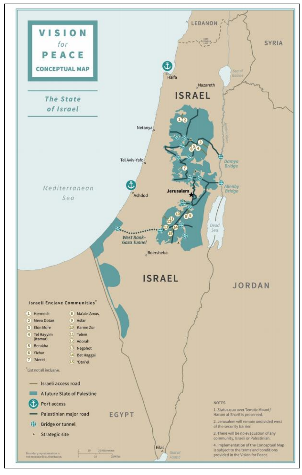
Figure 1. Conceptual Map of Israel