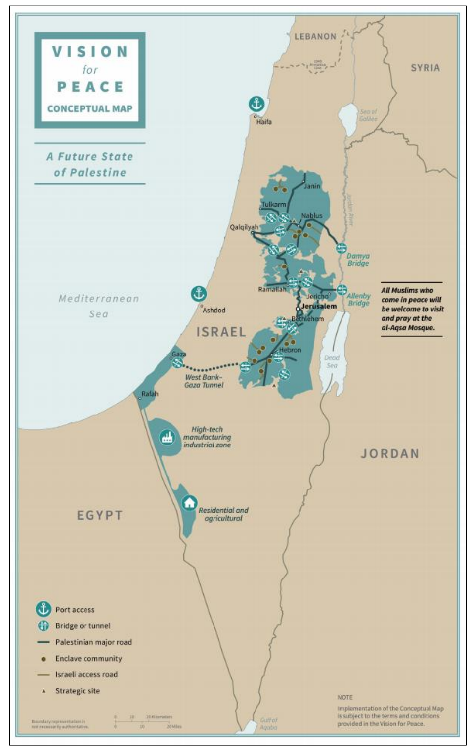
Figure 2. Conceptual Map of Future Palestinian State