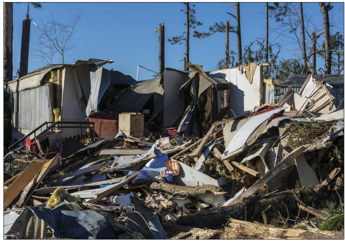
Figure I. Mixed Disaster Debris

EPA suggests, and most states generally attempt, to remove hazardous materials such as asbestos, lead-based paint, and other contaminated materials from C&D waste before landfill disposal. States may also attempt to lessen the burden on disposal facilities and potentially reduce costs by reusing and recycling C&D waste. However, if hazardous materials are mixed with C&D waste to the point that they cannot be segregated (see photo of mixed disaster debris in Figure 1 ), that waste may end up being disposed in a landfill that is not meant to safely receive such waste.