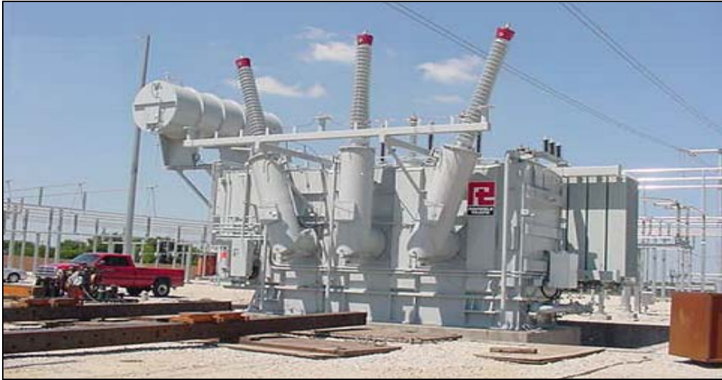
Figure 3. 345 kV Transformer Installation