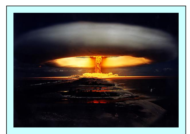
The decision to employ nuclear weapons carries significant political and psychological implications.

The physical effects of nuclear weapons are pronounced. The degree of destruction depends upon a number of factors such as weapon design and yield, location and height of burst, weather, and others. Planners must consider the political and military objectives and the desired degree of destruction as well as the local conditions, available weapons, and delivery The immediate operational impact of a nuclear detonation varies and may come from blast and heat, the subsequent electromagnetic pulse (EMP), or more far-reaching effects, depending on the variables discussed above. This will have an immediate effect on enemy forces, logistics, and C2. Communications and severely computer capability will be