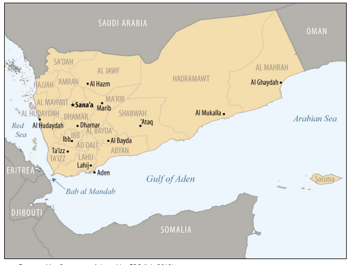
Figure 1. Map of Yemen