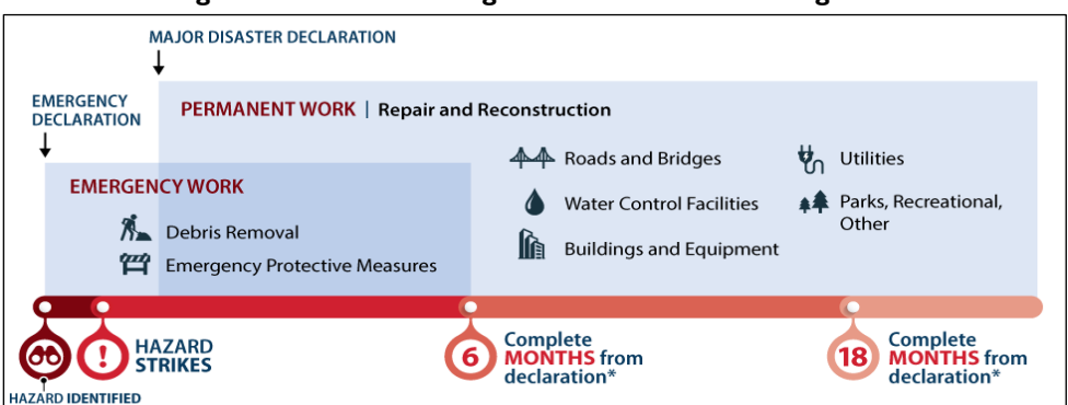
Figure I. General Timing of Public Assistance Programs

Source: Developed by CRS based on 44 C.F.R. §§206.40 and 206.204(c) and (d); and FEMA, "How a Disaster Gets Declared," https://www.fema.gov/disasters/how-declared.