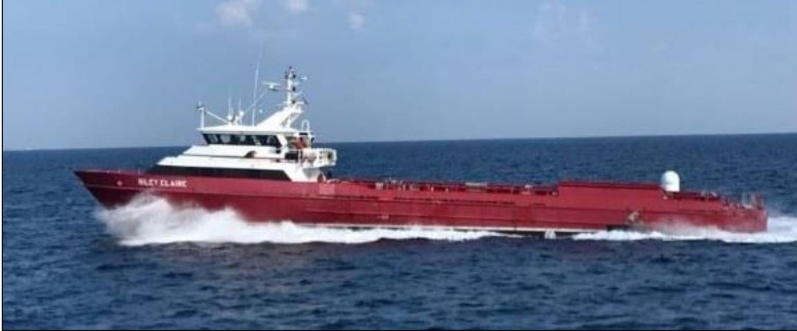
Figure 5. LUSV Prototype