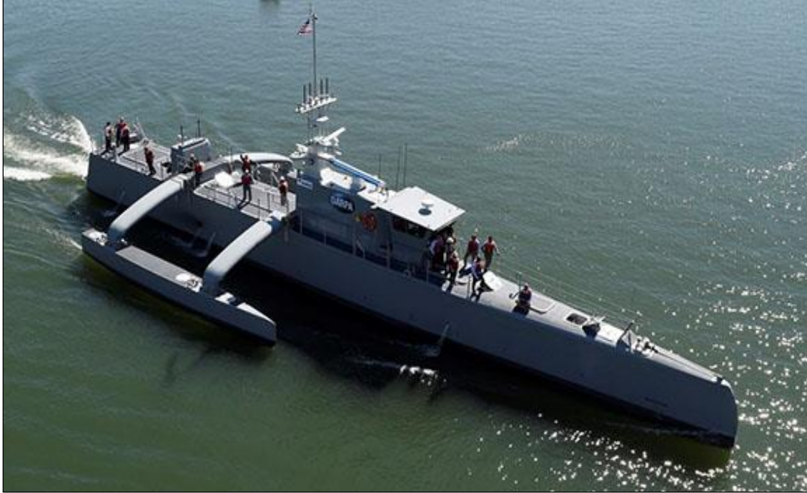
Figure 2. Sea Hunter Prototype Medium Displacement USV

Source: Photograph credited to U.S. Navy accompanying John Grady, “Panel: Unmanned Surface Vessels Will be Significant Part of Future U.S. Fleet,” USNI News , April 15, 2019.