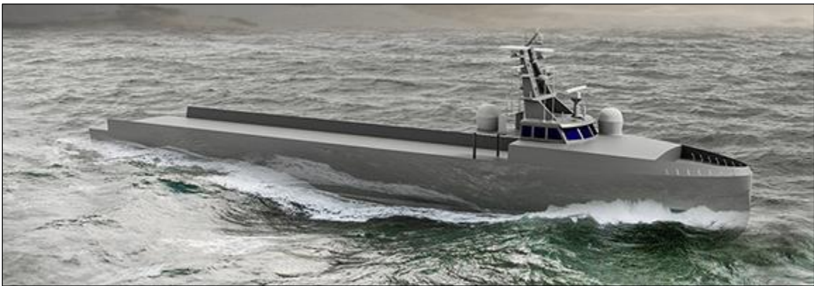
Figure 6. Rendering of L3Harris Design Concept for MUSV