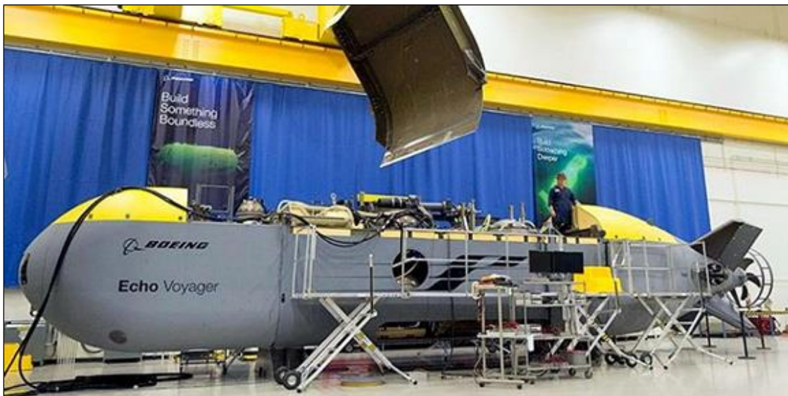
Figure 8. Boeing Echo Voyager UUV