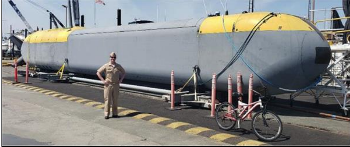
Figure 9. Boeing Echo Voyager UUV