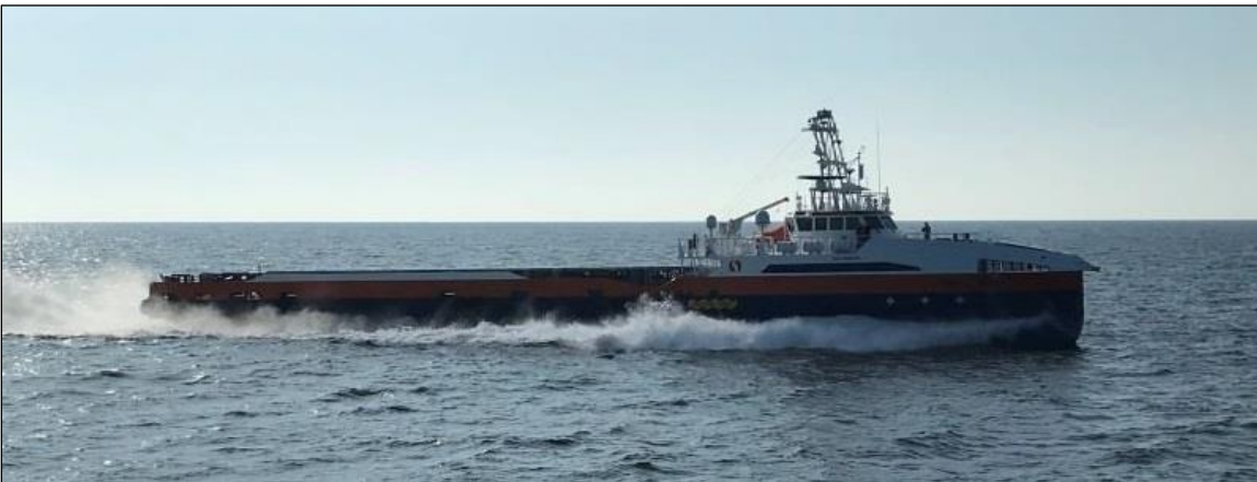
Figure 4. LUSV Prototype