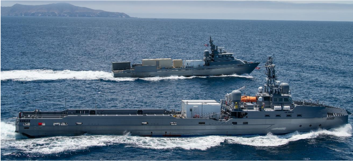
Figure 3. USV Prototypes

Source: Photograph from briefing slide entitled “UMS [unmanned maritime systems] at Sea,” slide 4 of 5 (including cover slide) of Navy briefing entitled “PMS 406 Unmanned Maritime Systems, Program Overview, August 2021, prepared for Sea-Air-Space Exposition. The briefing slide states that the photograph shows “Overlord USVs Ranger & Nomad on the West Coast.”