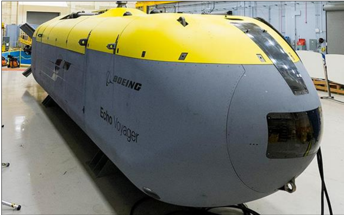
Figure 7. Boeing Echo Voyager UUV