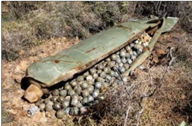
Figure 2. Unexploded Aerial Cluster Bomb and Submunitions