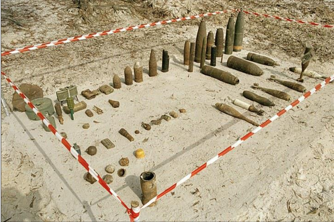
Figure 1. UXO Recovered in Vietnam, 2005