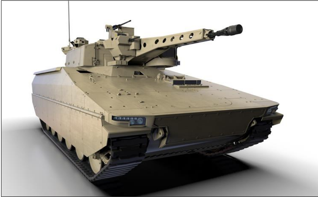
Figure 4. Raytheon/Rheinmetall Lynx Prototype

Source: https://www.rheinmetall-defence.com/en/rheinmetall_defence/systems_and_products/vehicle_systems/armoured_tracked_vehicles/lynx/index.php , accessed January 31, 2019.