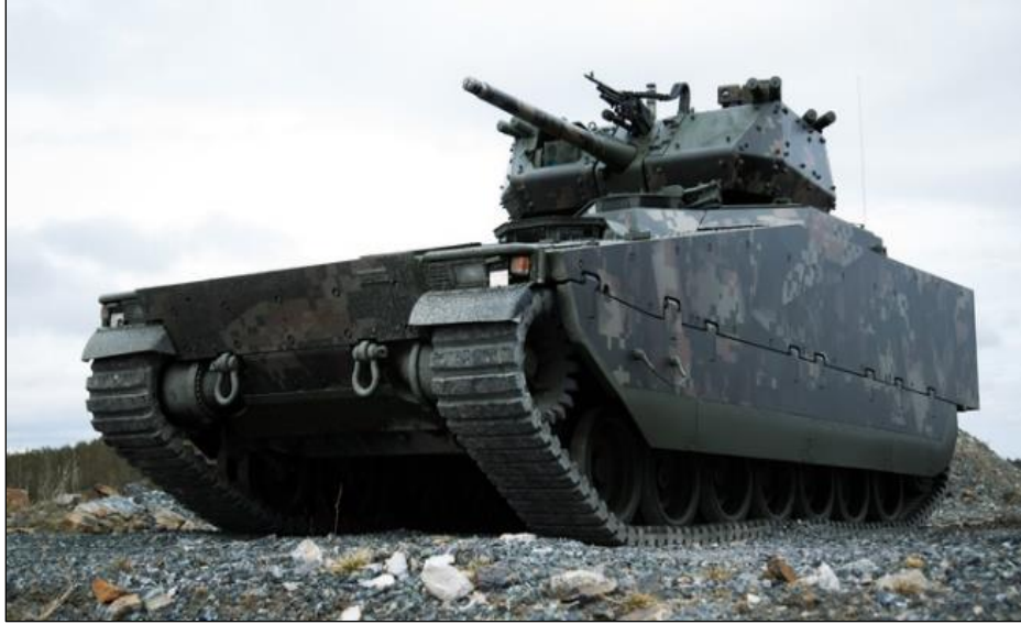
Figure 2. BAE Prototype CV-90