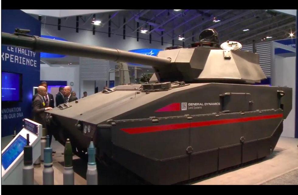
Figure 3. GDLS Griffin III Prototype