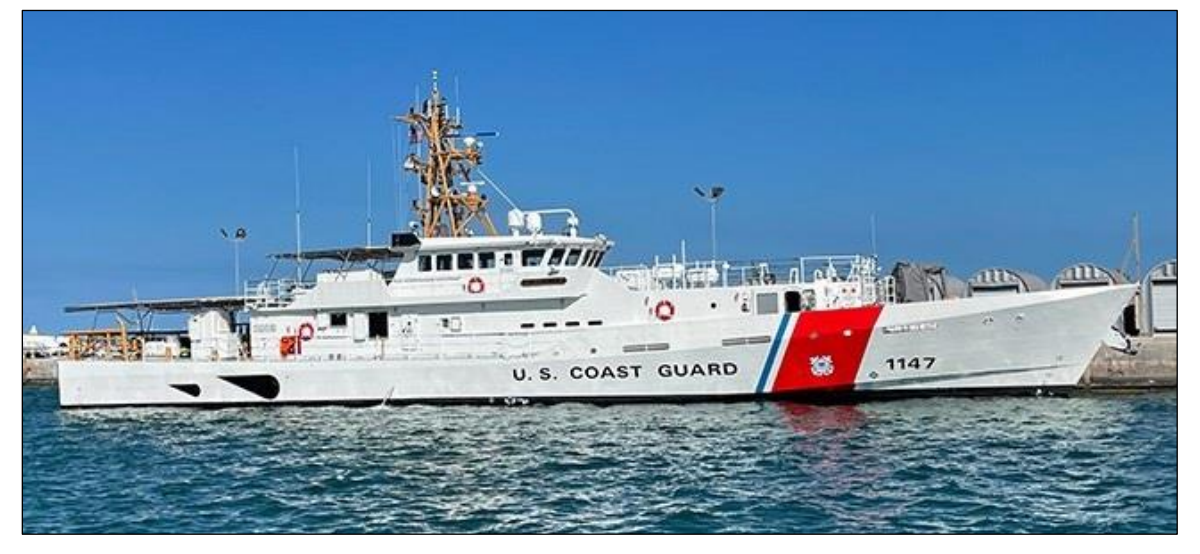
Figure 11. Fast Response Cutter

Indo-Pacific region. The Coast Guard's proposed FY2025 budget requests $216.0 million in procurement funding for the FRC program for the procurement of two more FRCs for operations in the Indo-Pacific region, plus additional FRC program costs.