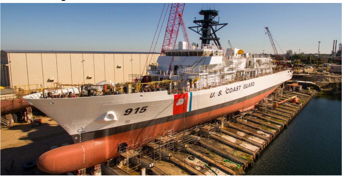
Figure 8. First Offshore Patrol Cutter Under Construction