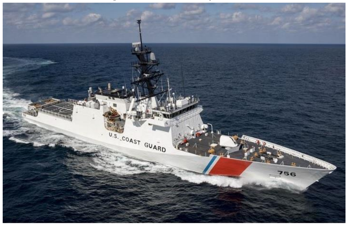
Figure 1. National Security Cutter

National Security Cutters ( Figure 1 and Figure 2 )—also known as Legend (WMSL-750)<sup>12</sup> class cutters because they are being named for legendary Coast Guard personnel<sup>13</sup>—are the Coast Guard's largest and most capable general-purpose cutters.<sup>14</sup> They are larger and technologically more advanced than Hamilton-class cutters, and are built by Huntington Ingalls Industries' Ingalls Shipbuilding of Pascagoula, MS (HII/Ingalls).