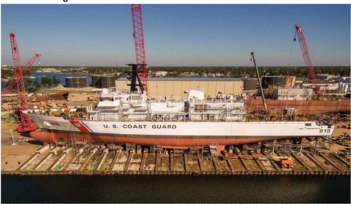
Figure 7. First Offshore Patrol Cutter Under Construction

Source: Photograph accompanying Allyson Park, "Coast Guard Launching First Offshore Patrol Cutter," National Defense , October 17, 2023. The caption credits the photograph to Eastern Shipbuilding.