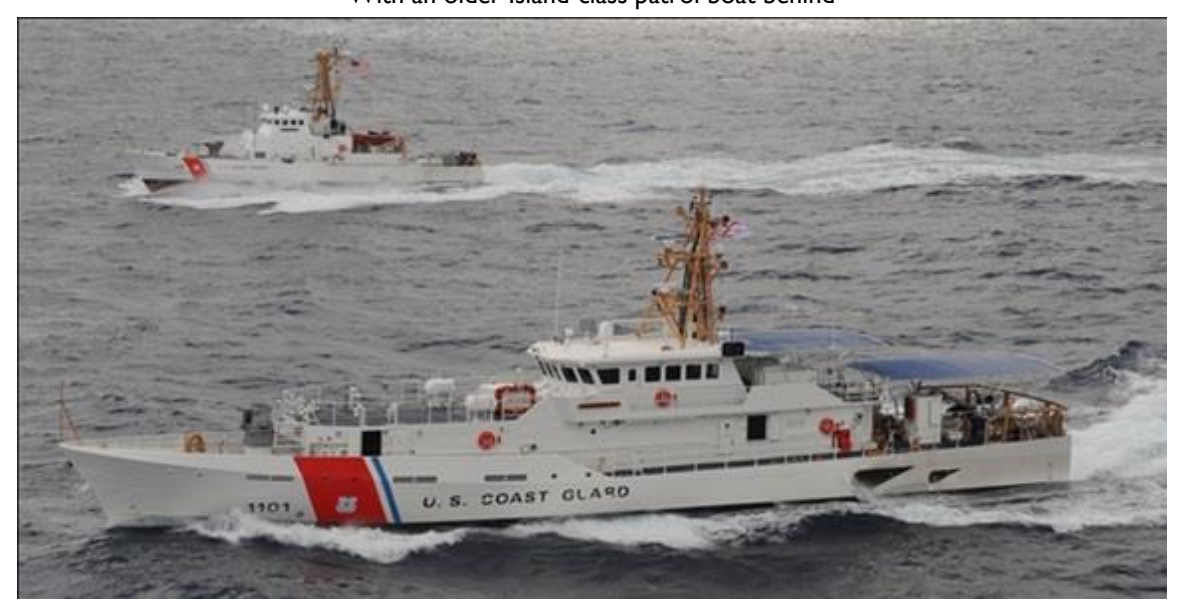
Figure 10. Fast Response Cutter With an older Island-class patrol boat behind

heroes of the Coast Guard and its predecessor services of the U.S. Revenue Cutter Service, U.S. Lifesaving Service, and U.S. Lighthouse Service.<sup>48</sup>