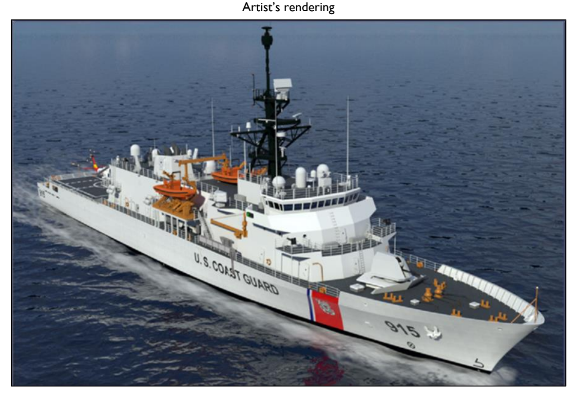
Figure 3. Offshore Patrol Cutter

proposed FY2025 budget requests $530.0 million in procurement funding for the construction of (once again) the sixth OPC and other OPC program costs, and states that the requested FY2024 procurement funding would now be for the construction of the fifth OPC rather than the sixth.