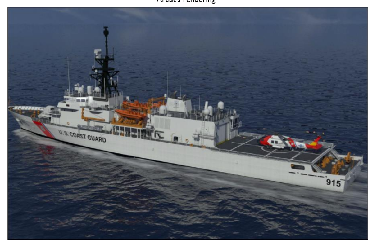
Figure 6. Offshore Patrol Cutter Artist's rendering