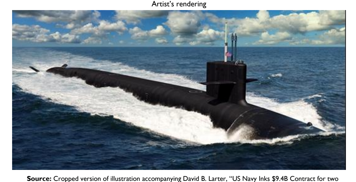
Figure 2. Columbia (SSBN-826) Class SSBN

The Columbia-class design (see Figure 2 and Figure 3 ) includes 16 SLBM tubes, as opposed to 24 SLBM tubes (of which 20 are now used for SLBMs) on Ohio-class SSBNs. Although the Columbia-class design has fewer SLBM tubes than the Ohio-class design, it is larger than the Ohio-class design in terms of submerged displacement. The Columbia-class design, like the Ohio-class design before it, will be the largest submarine ever built by the United States.