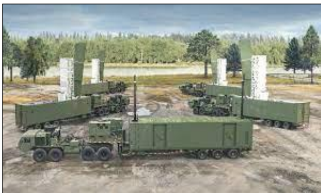
Figure 1. Typhon Launchers and Battery Operations Center