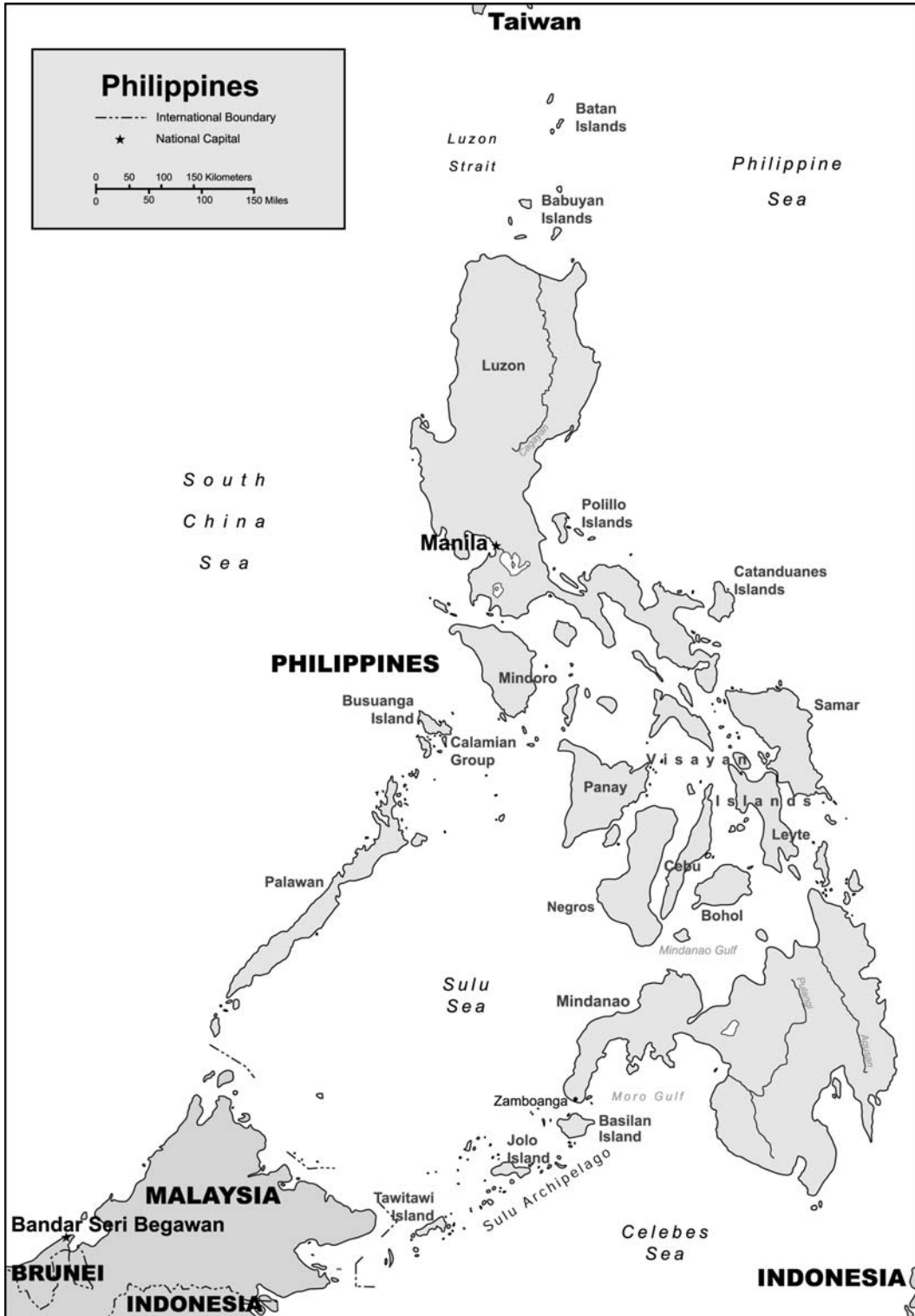
Figure 5. The Philippines