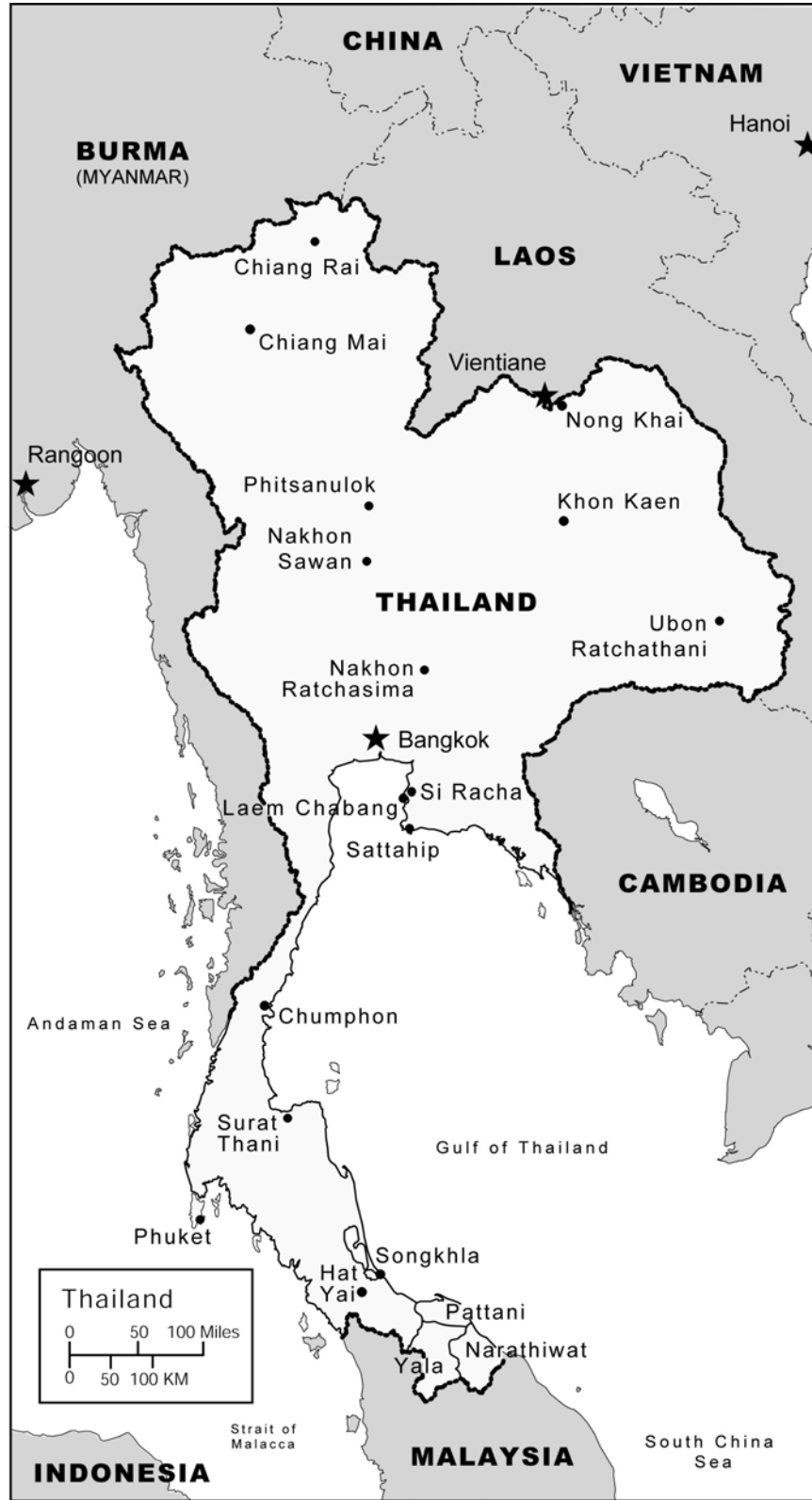
Figure 6. Thailand