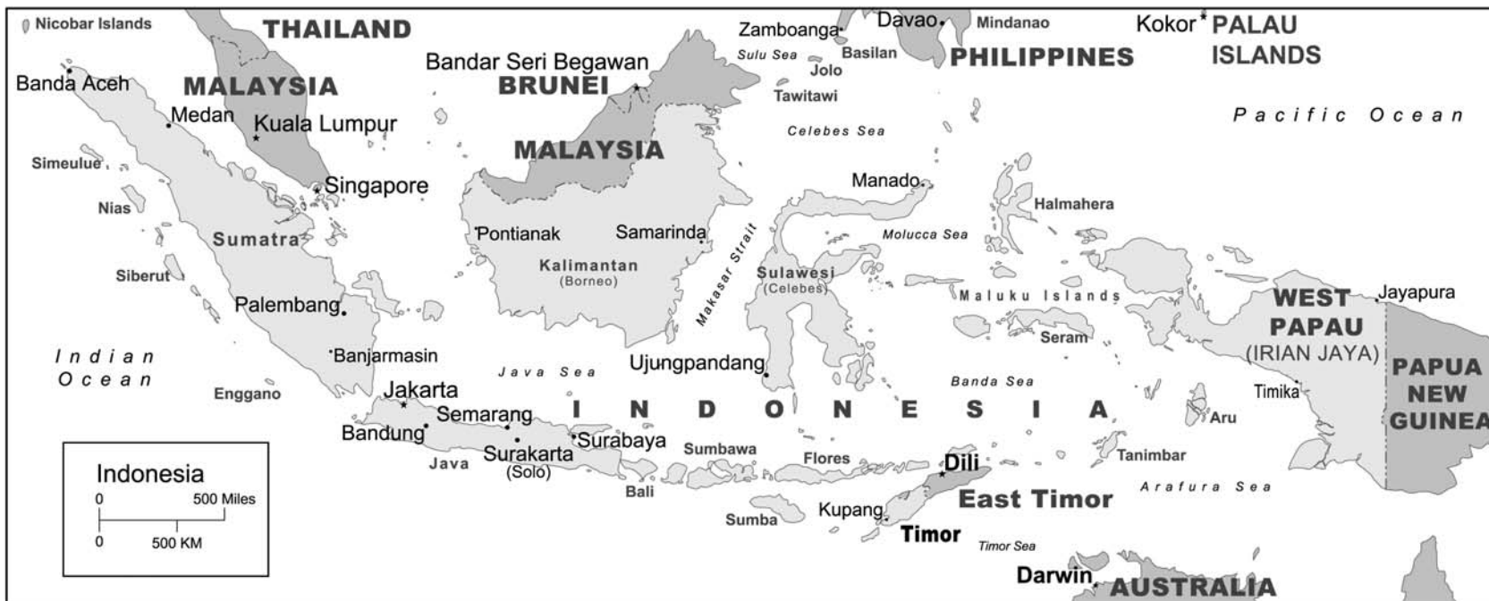
Figure 3. Indonesia