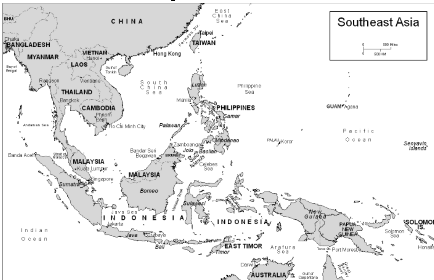
Figure 2. Southeast Asia