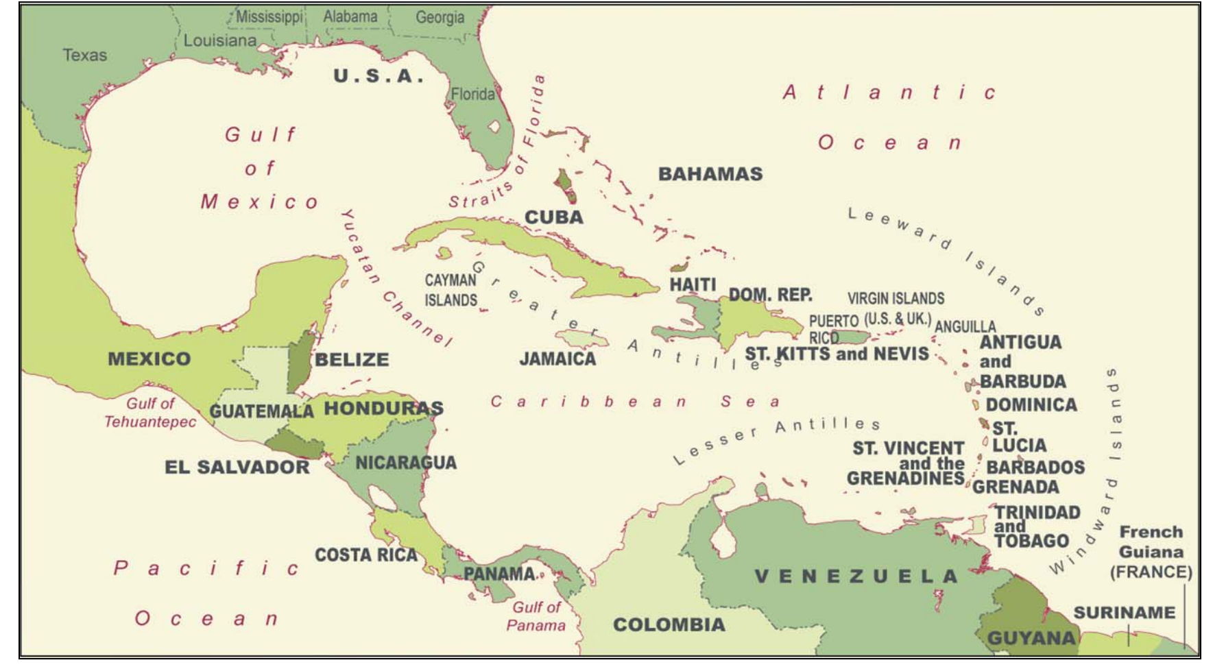
Figure I. Map of the Caribbean Basin