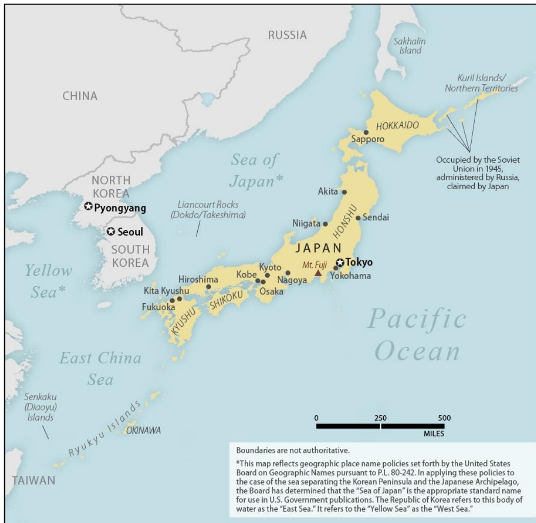
Figure I. Map of Japan

Passage of the Asia Reassurance Initiative Act (ARIA, P.L. 115-409) in late 2018 conveyed broad bipartisan support for the alliance. 7 At a time when some U.S. allies are questioning the credibility and durability of the U.S. commitment to its alliances and to remaining an Asian power, ARIA aims to reassure U.S. allies that Congress is committed to a long-term strategy in the Indo-Pacific. The act emphasizes the need to “expand security and defense cooperation with allies and partners” and to “sustain a strong military presence in the Indo-Pacific region.” The act recognizes the value of the U.S.-Japan alliance in promoting peace and security in the region; calls on the executive branch to deepen trilateral security cooperation with South Korea and Japan; and expresses support for the quadrilateral security dialogue with India and Australia. Among other things, the legislation imposes new reporting requirements on the executive branch and authorizes $1.5 billion annually to support various security initiatives.