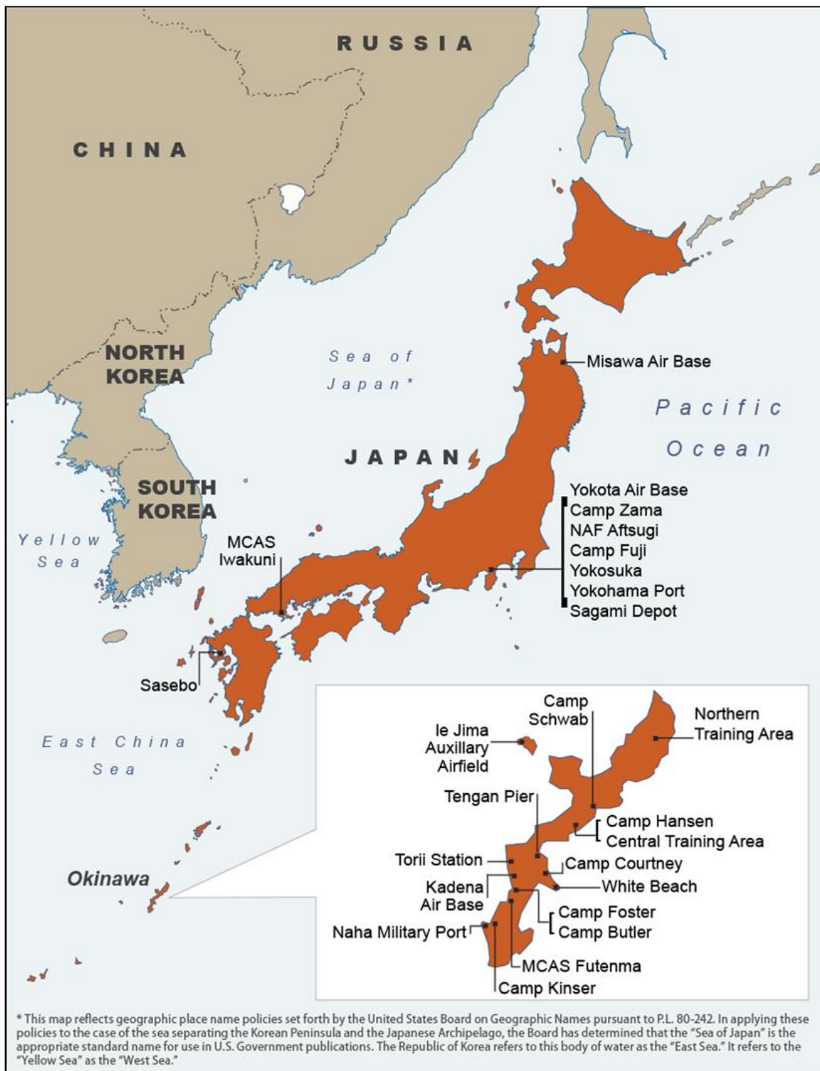
Figure 4. Map of U.S. Military Facilities in Japan