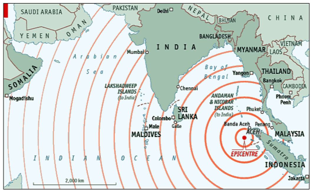
Figure 1. Map of the 2004 Indian Ocean Earthquake and Tsunami