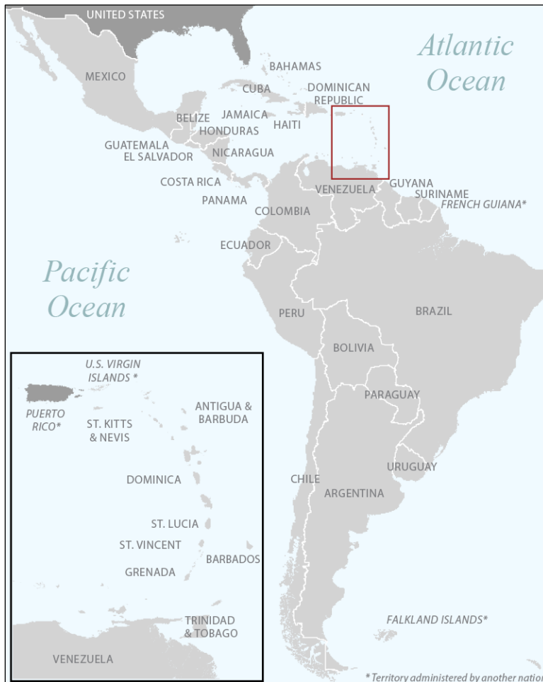
Figure 1. Map of Latin America and the Caribbean