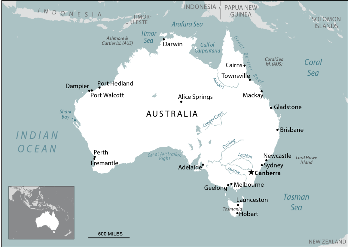
Figure 2. Map of Australia