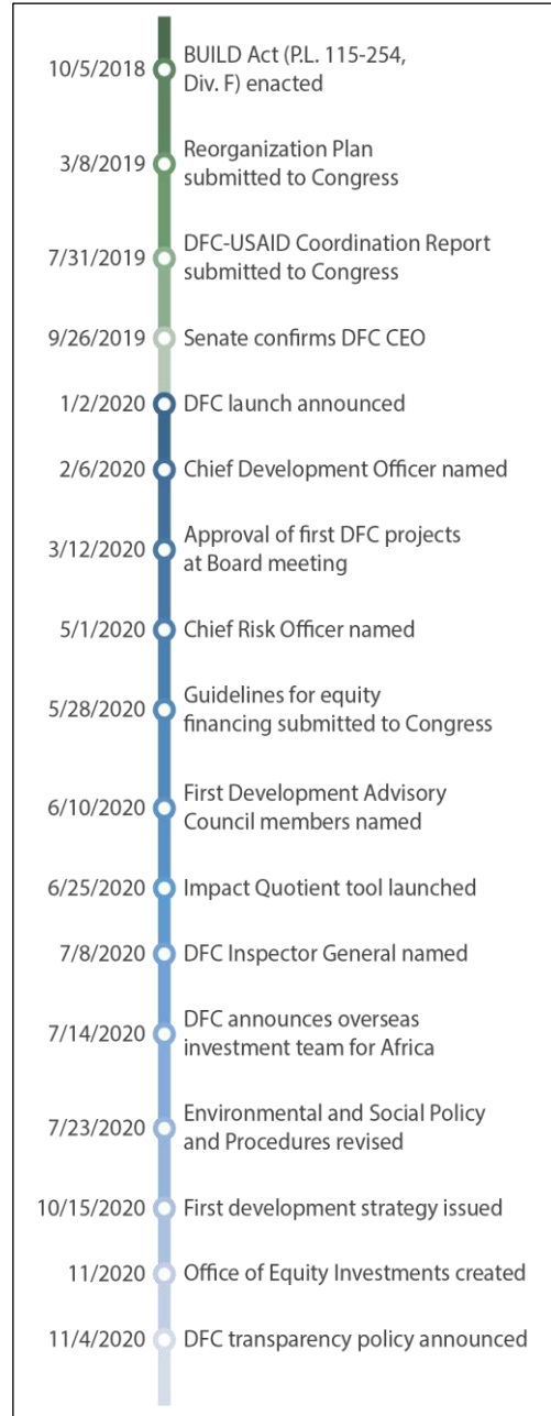
Figure 2. Milestones in DFC Mobilization