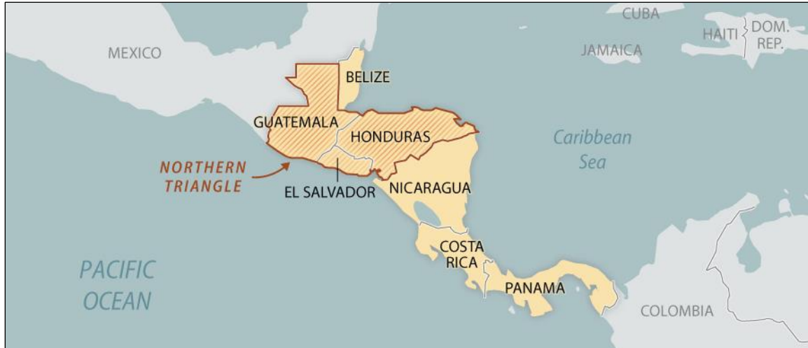
Figure 3. Map of Central America