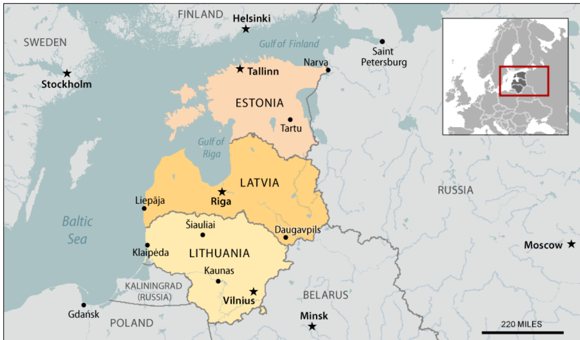
Figure 1. Map of the Baltic Region