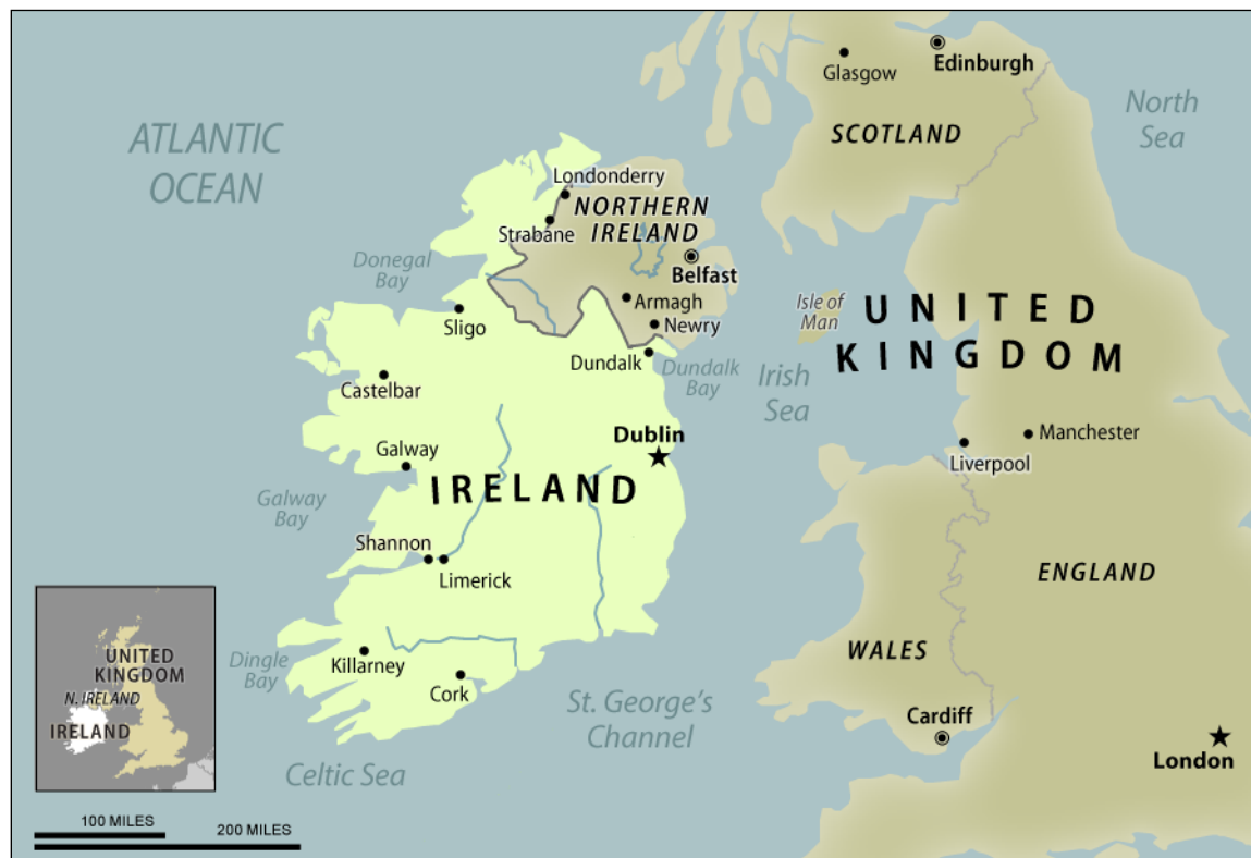
Figure 2. Map of Northern Ireland (UK) and the Republic of Ireland