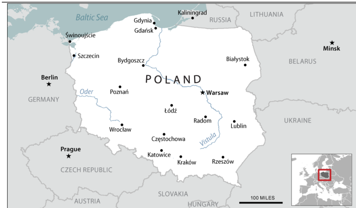
Figure 1. Poland: Map and Basic Facts

Area: Land area is about 120,728 sq. mi.; slightly smaller than New Mexico.