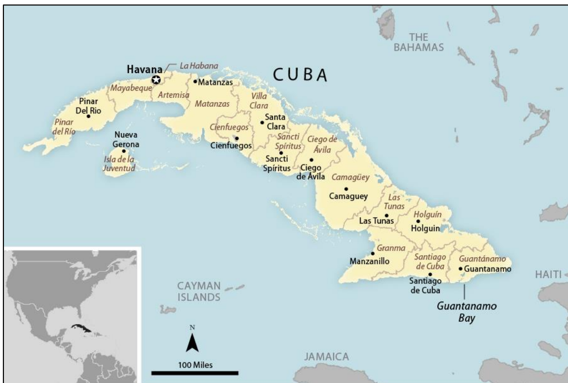
Figure I. Provincial Map of Cuba

Beginning in 2019, the Trump Administration significantly expanded U.S. economic sanctions on Cuba by reimposing many restrictions eased under the Obama Administration and imposing a series of strong sanctions designed to pressure the government on its human rights record and for its support for the Nicolás Maduro government in Venezuela. These actions included allowing lawsuits against those trafficking in property confiscated by the Cuban government, tightening restrictions on U.S. travel and remittances to Cuba, attempting to stop Venezuelan oil exports to Cuba, and, in January 2021, designating the Cuban government a state sponsor of international terrorism.