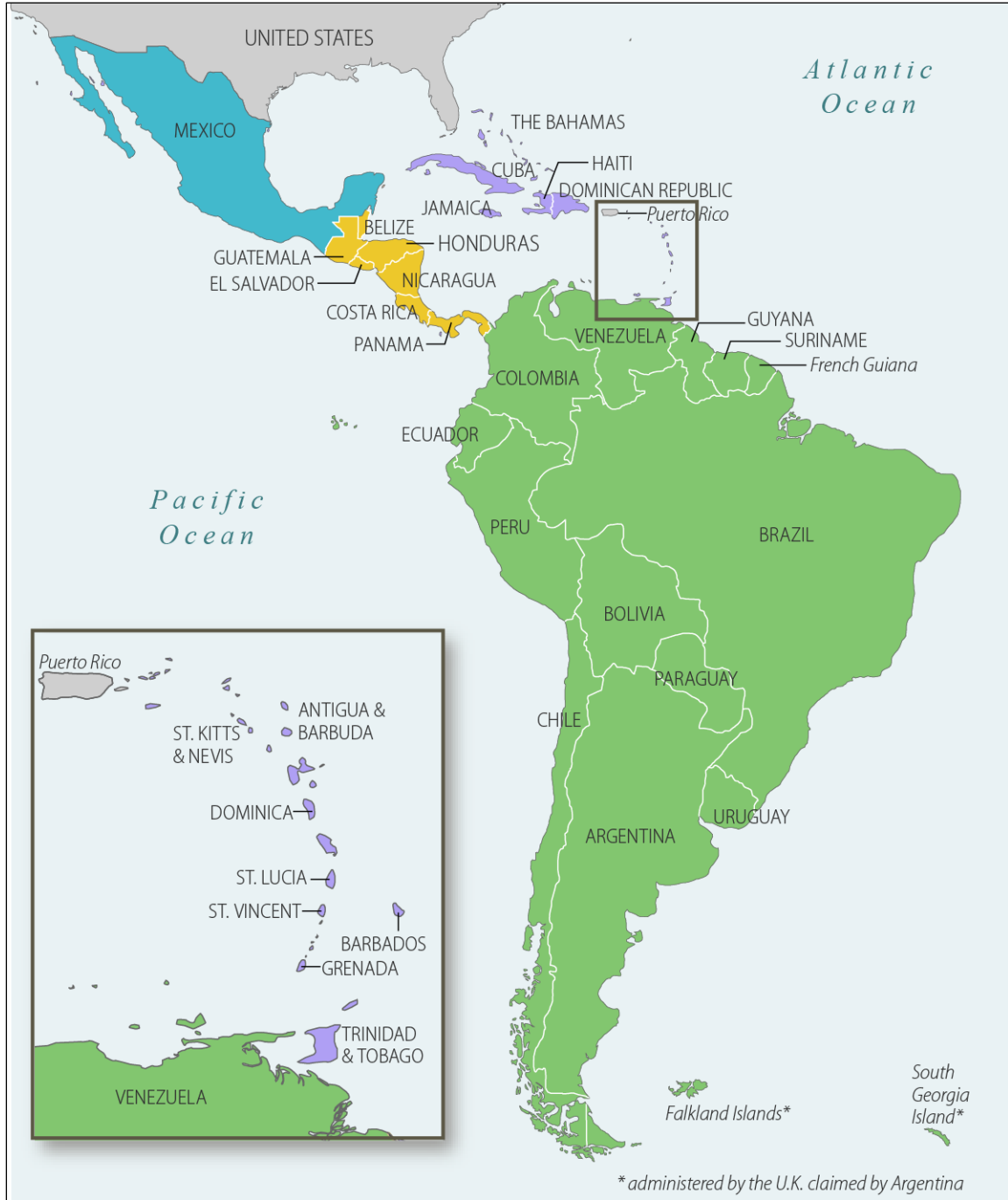
Figure I. Map of Latin America and the Caribbean