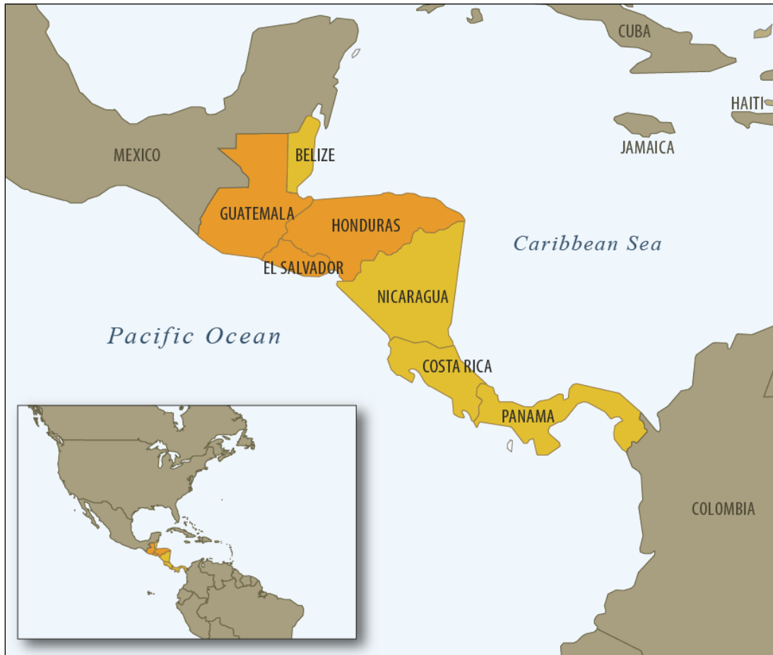
Figure 3. Map of Central America

Commission against Impunity in Guatemala (CICIG) and the Organization of American States-backed Mission to Support the Fight against Corruption and Impunity in Honduras (MACCIH)—have made significant progress in the investigation and prosecution of high-level corruption cases. Their efforts have generated fierce backlashes, however, and the Guatemalan and Honduran governments repeatedly have sought to undermine CICIG and MACCIH over the past year. (Also see section on “Corruption,” above.)