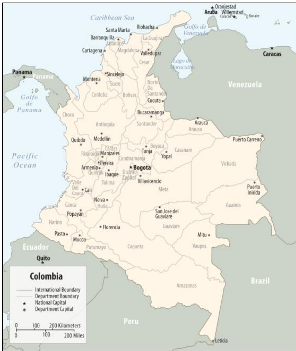
Figure I. Map of Colombia Showing Departments and Capital