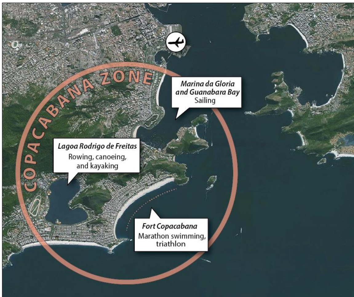
Figure 3. Rio2016™ Water Venue Locations