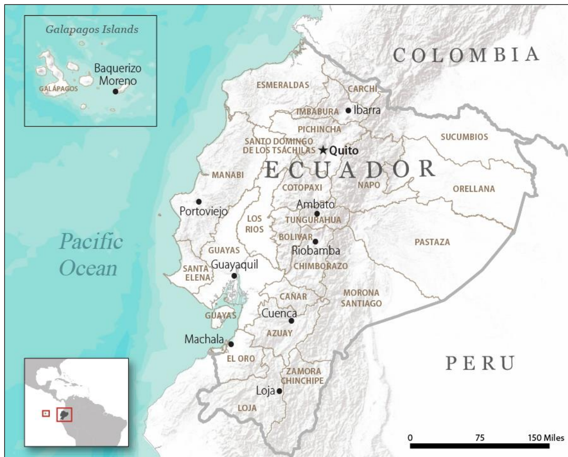
Figure I. Map of Ecuador and Ecuador at a Glance