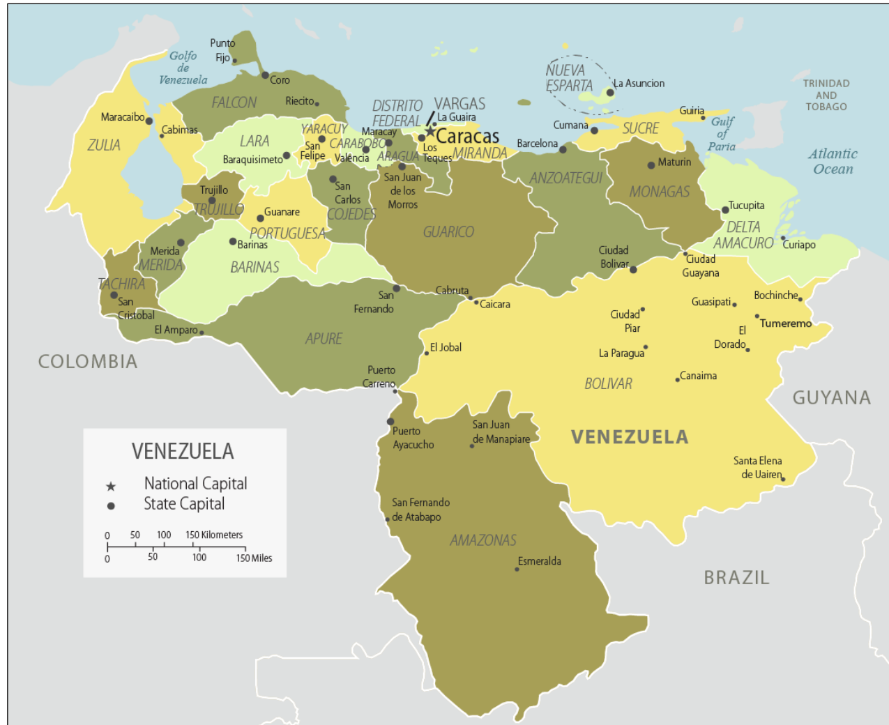
Figure I. Political Map of Venezuela