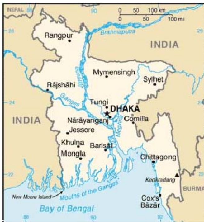
Figure 1. Map of Bangladesh

On April 24, 2013, Rana Plaza, an eight-story building, in Dhaka, Bangladesh, collapsed, killing more than 1,100 garment workers. It brought international focus on portions of the global supply chain. It also raised the issue of what might be done to improve working conditions, especially for lower-wage workers in developing countries around the world.