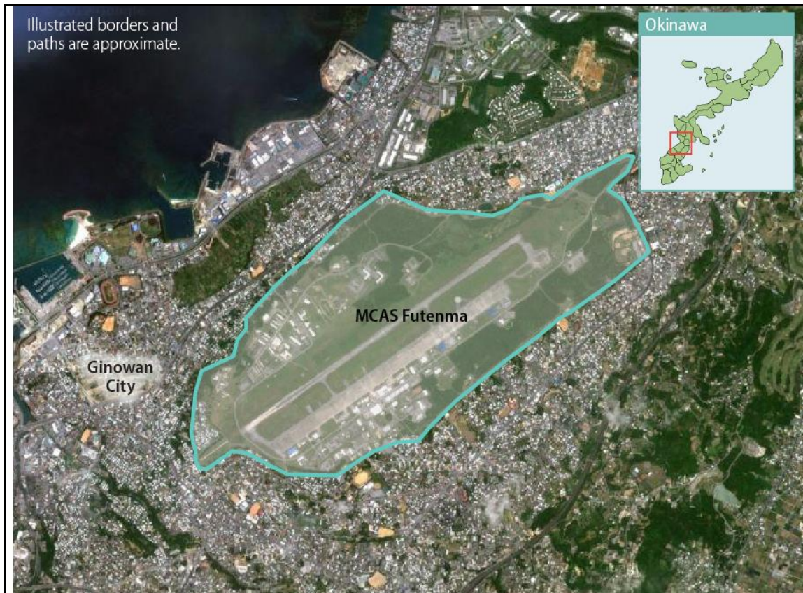
Figure 4. MCAS Futenma

The base is located within a dense urban area, surrounded by schools and other facilities that are subjected to the high noise levels that accompany an active military training site. (See Figure 4 .) A new equipment accident or serious crime committed by a U.S. servicemember could galvanize further Okinawan opposition to the U.S. military presence on the island.