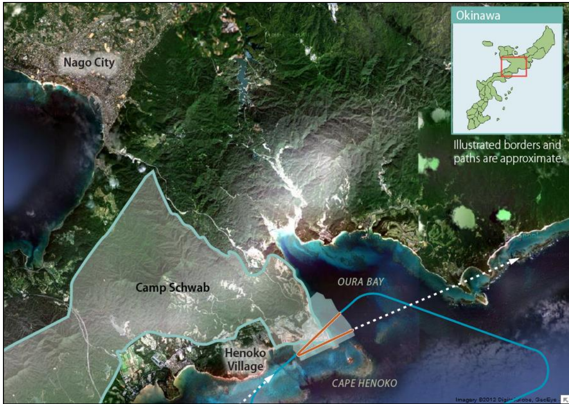
Figure 3. Location of Proposed Futenma Replacement Facility