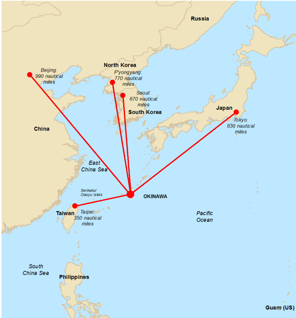
Figure 2. Okinawa's Strategic Location