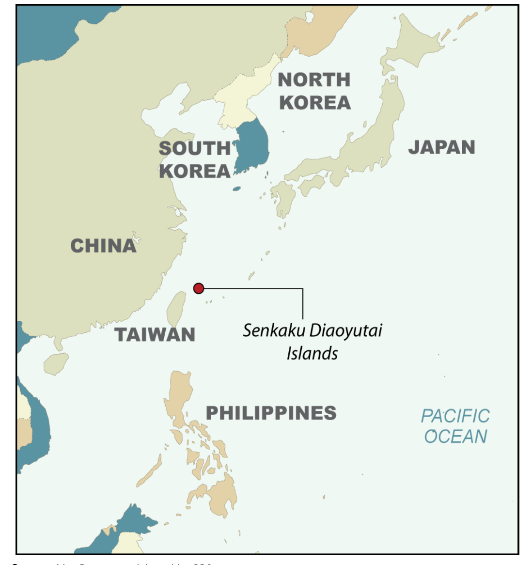
Figure 4: Map of Japan and China

9/17/08—Japanese Defense Minister Yoshimasa Hayashi and Chinese air force chief Gen. Xu Qiliang agree that there is a need to enhance bilateral defense exchanges. Xu is the first commander of the People's Liberation Army Air Force to visit Japan since 2001.