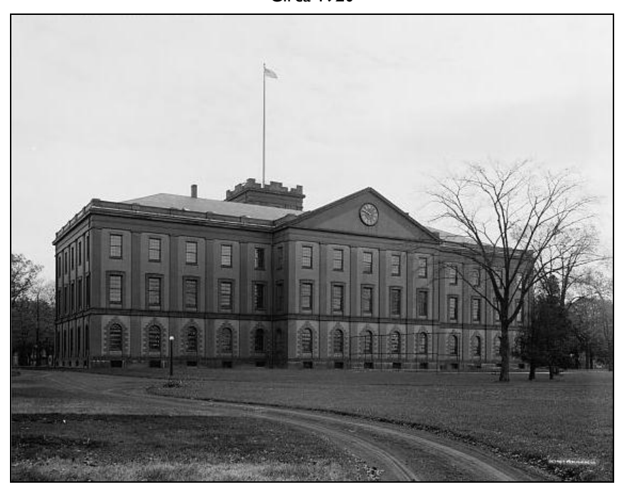
Figure 1. Springfield, MA, Arsenal Circa 1920