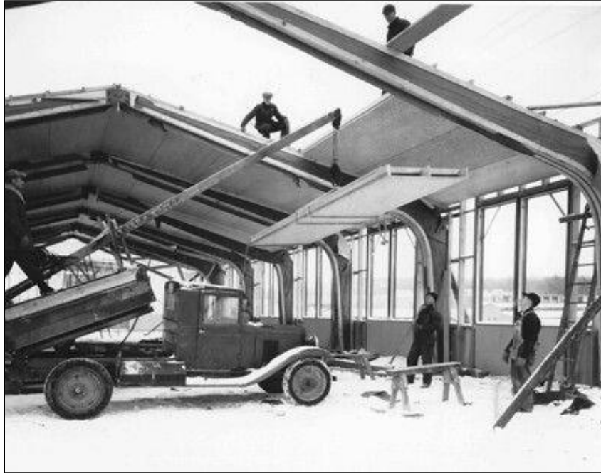
Figure 3. Example of a Historical Forest Service Mass Timber Building

Supporting information is from James Spartz, “Historic Glued-Laminated Arches Evaluated for Structural Quality,” Forest Service, Forest Products Laboratory Lab Notes, January 13, 2013; Douglas Rammer and Jorge de Melo Moura, Structural Evaluation of the Second-Oldest Glued-Laminated Structure in the United States , Forest Service, Forest Products Laboratory, General Technical Report, FPL-GTR-226, 2013, pp. 269-276; Eben Lehman, “October 15, 1934: Glued Laminated Timber Comes to America,” Forest History Society, October 15, 2018; and James Spartz, “Soy Proteins as Wood Adhesives,” Forest Service, Forest Products Laboratory Lab Notes, May 6, 2014.