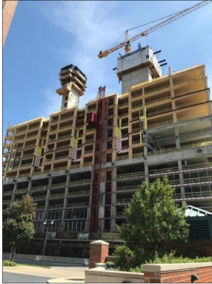
Figure 4. Example of a Tall Wood Building

Additional information: ThinkWood, “Ascent,” accessed June 15, 2023, at https://www.thinkwood.com/construction-projects/ascent ; TimberLab, “Ascent,” accessed June 15, 2023, at https://timberlab.com/projects/ascent .