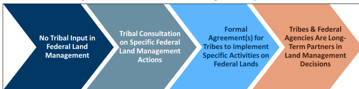
Figure 2. Federal-Tribal Co-management Spectrum