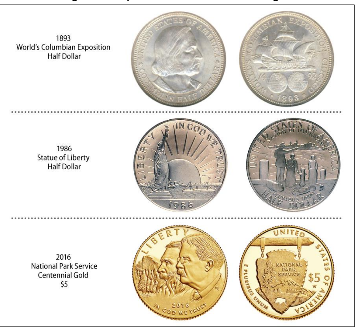
Figure 2. Examples of Commemorative Coin Designs

Sources: "Columbian Exposition Half Dollar," Early Commemorative Coins, at