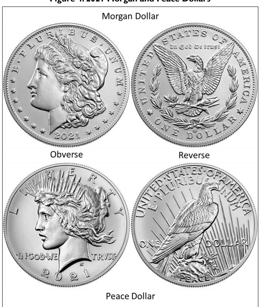
Figure 4. 2021 Morgan and Peace Dollars

In the 116<sup>th</sup> Congress (2020-2021), the 1921 Silver Dollar Coin Anniversary Act was enacted.<sup>81</sup> This law required the U.S. Mint to issue silver dollar coins in 2021 in honor of the 100<sup>th</sup> anniversary of the Morgan Dollar and the 100<sup>th</sup> anniversary of the Peace Dollar. The U.S. Mint has since issued Morgan and Peace Dollar coins in 2023 and plans to do so for 2024.<sup>82</sup> Figure 4 shows the 2021 Morgan and Peace Dollar coins.