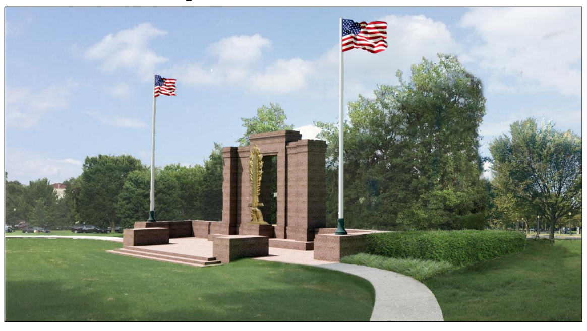
Figure 3. Second Division Memorial

Source: Second Infantry Division Association Memorial Foundation, "Second Infantry Division Memorial Modification," CFA Submission, November 19, 2020, p. 21, at https://www.cfa.gov/system/files/meeting-materials/CFA-19NOV20-2-Second_Division_Memorial_%28pres%29.pdf.