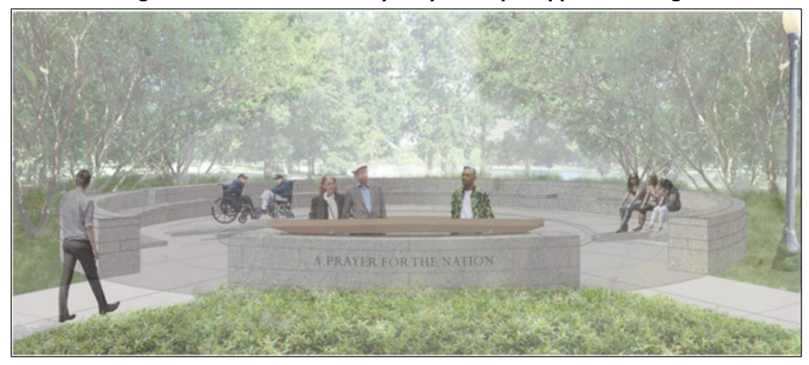
Figure 2. World War II D-Day Prayer Plaque Approved Design

The prayer plaque will be located at the "Circle of Remembrance" on the northwest side of the World War II Memorial.<sup>25</sup> Final prayer plaque design approval was granted by NCPC in June 2021,<sup>26</sup> and by CFA in January 2022.<sup>27</sup> On December 20, 2022, the Friends of the National World War II Memorial held an unveiling ceremony of the plaque at the Circle of Remembrance.<sup>28</sup> A formal dedication ceremony will take place in 2023.<sup>29</sup> Figure 2 shows the proposed location of the plaque at the Circle of Remembrance.