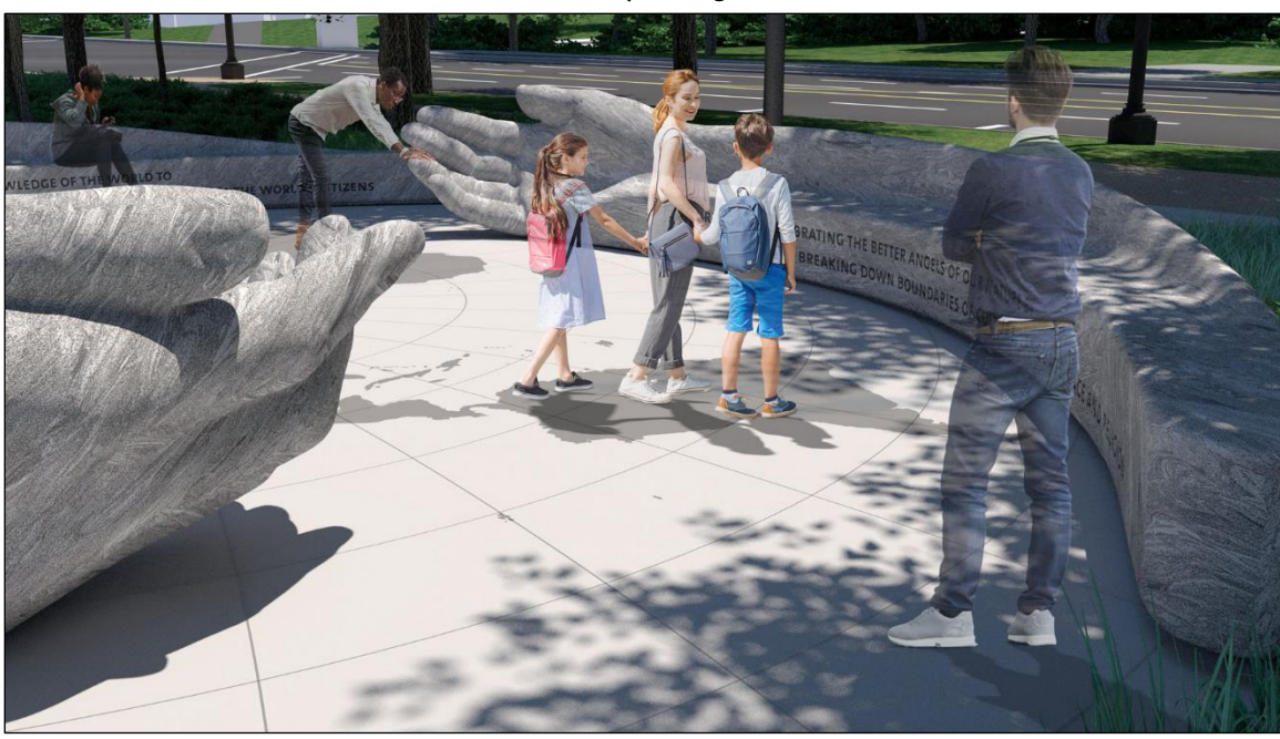
Figure 4. Peace Corps Memorial

In the 116<sup>th</sup> Congress, the Peace Corps Commemorative Foundation's authority to construct a memorial was extended until January 24, 2028.<sup>39</sup> Figure 4 shows the concept design for the Peace Corps Memorial as presented to CFA and NCPC.